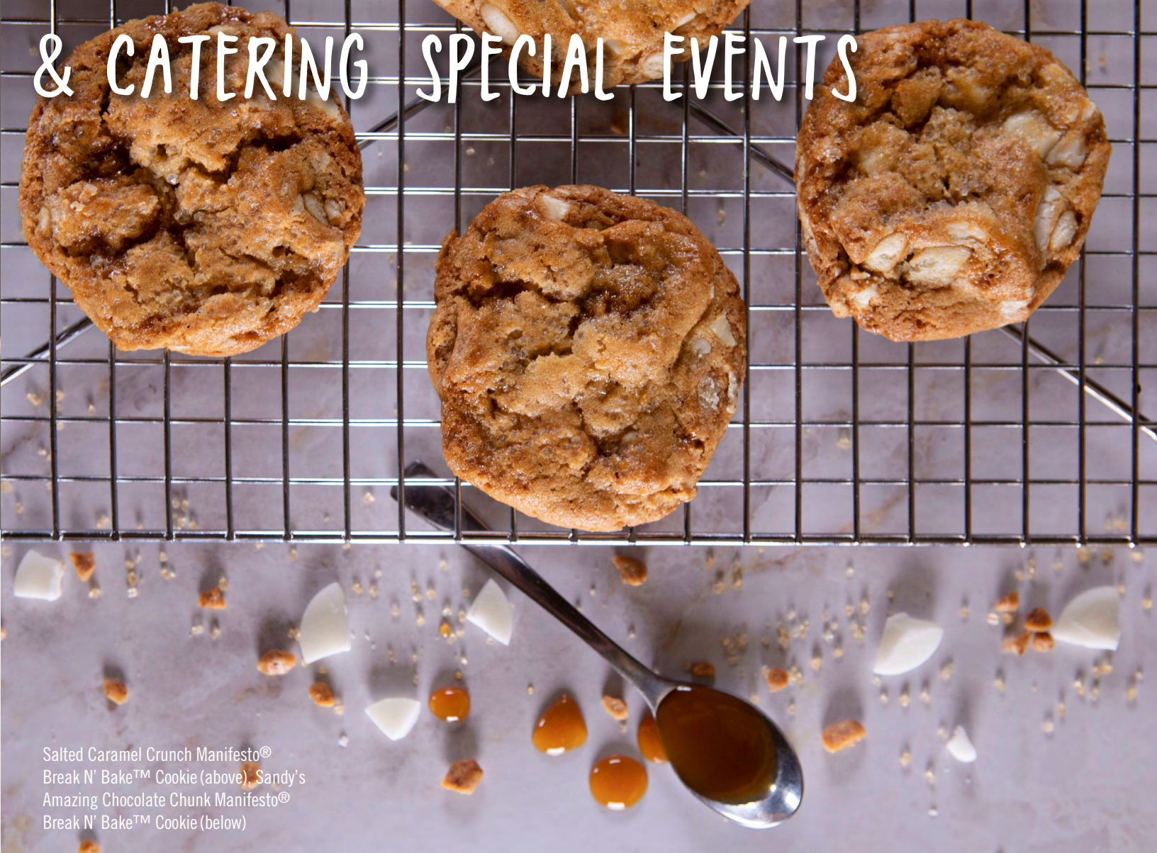
Salted Caramel Crunch Manifesto® Break N' Bake™ Cookie (above), Sandy's Amazing Chocolate Chunk Manifesto® Break N' Bake™ Cookie (below)