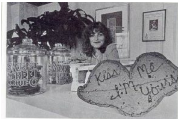
Sweet Street Cookie-grams are giant greetings, from one to two pounds, in any shape, with any message. For Christmas send a two-pound Christmas tree or Santa Claus. Send housewarming messages, get-well cookies, a sweet thought to someone you love. We will design a cookie-gram for any special occasion. Also for Christmas—our gourmet cookies by the pound: chocolate chip, oatmeal raisin, peanut butter, butterscotch chip, and coconut chocolate chip, and, our trademark, our giant chocolate chip cookies. (Yes, those perfect apothecary jars are for sale, too.) Monday to Friday, 8 to 4:30. SWEET STREET COOKIE COMPANY, 403 NORTH THIRTEENTH STREET, HEADING, BERKS COUNTY, 215/373-0946.

Not too different from the challenges of the past, today women-owned businesses are struggling with: access to capital, childcare responsibilities, and the subtle societal prejudice against women entrepreneurs. According to the 2020 report from National Women's Business Council (NWB), more than 57% of microloans are going to women entrepreneurs, but female founders received only 2.2% of venture capital dollars in 2018.